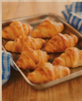
Edlong Dairy Flavors