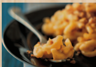
Kraft Food Ingredients